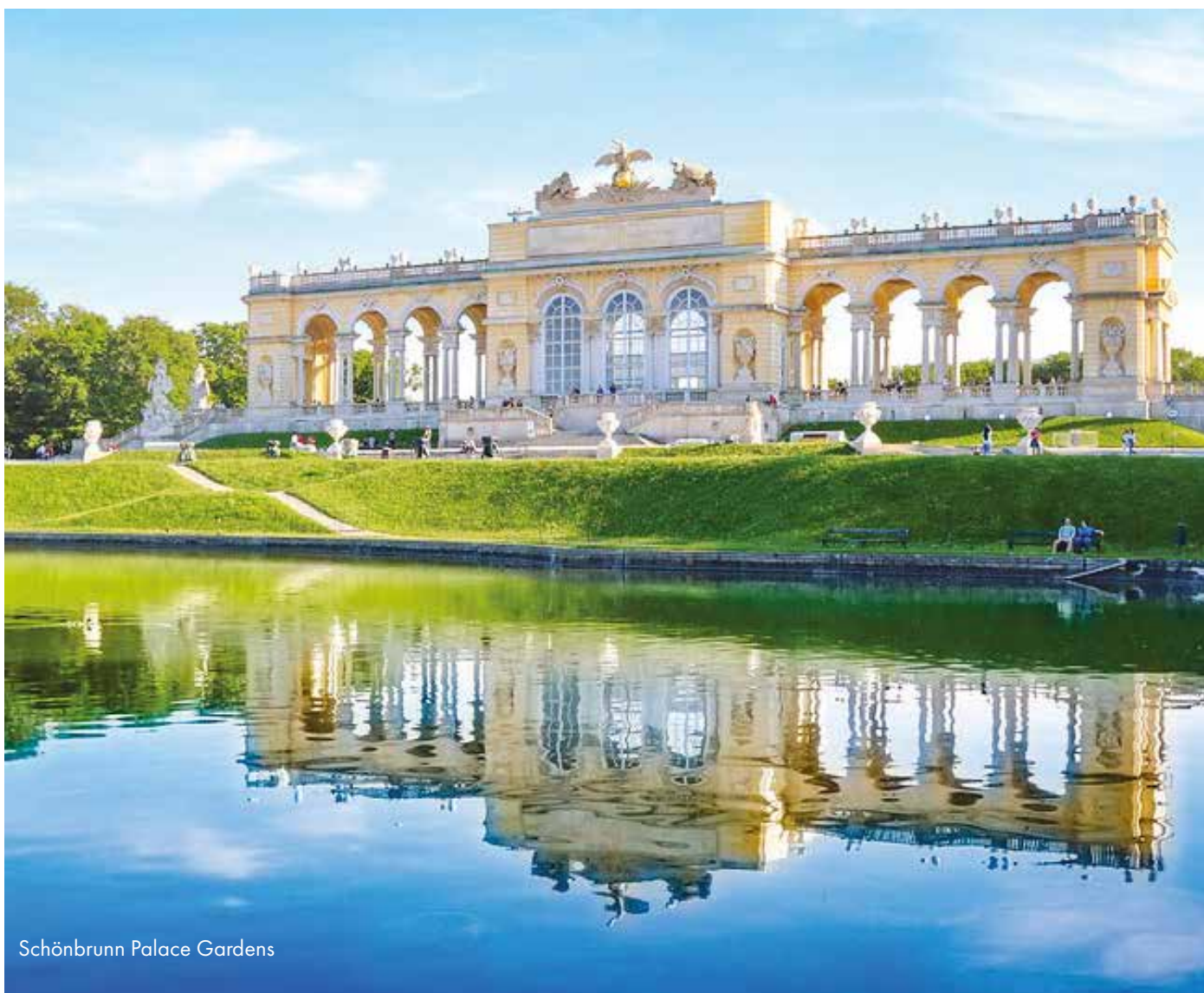
Schönbrunn Palace Gardens