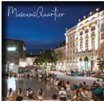
Musiktheater an der Wien and Wiener Taschenoper