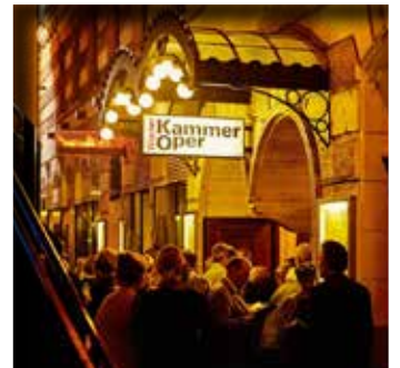
Musiktheater an der Wien - Kammeroper