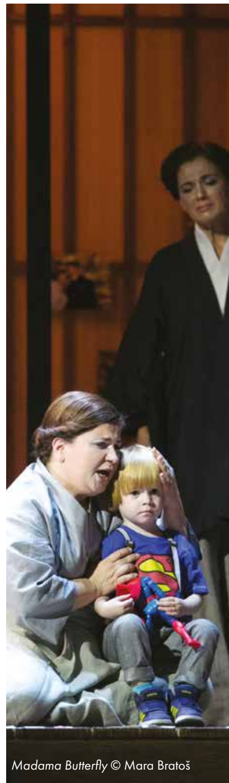
Madama Butterfly